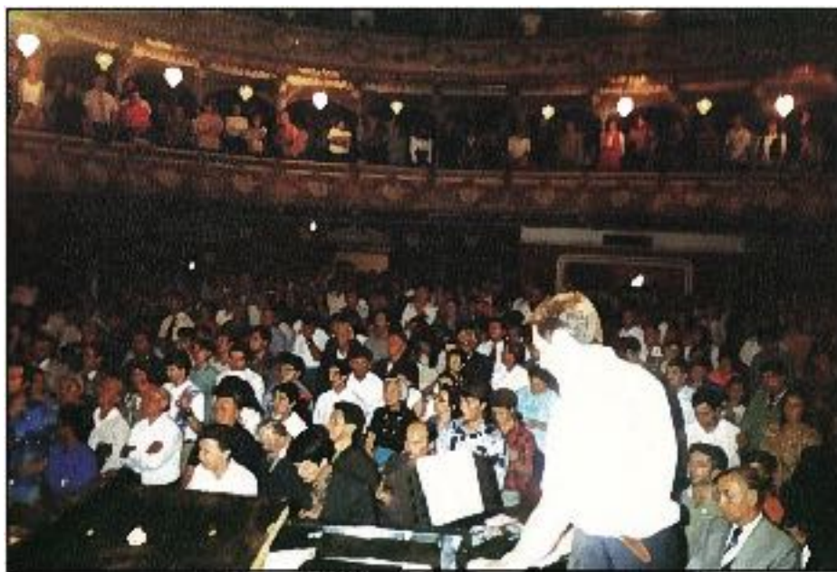
One of several meetings in 5 different cities in Romania in August, 1996: the packed State Theatre seating 3,000 people.