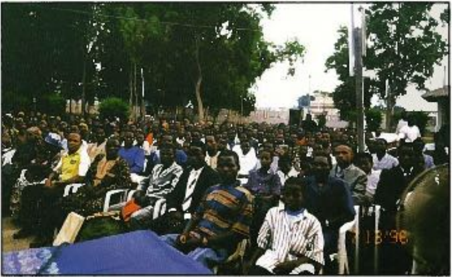
An audience in Cotonou, Benin, Central Africa, in July, 1996