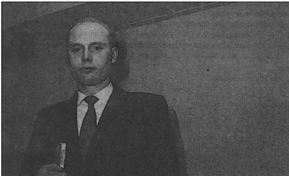
The above photo was taken in 1953 at the beginning of ministry, he photo below in April 1986, holding tickets at the local press interview.