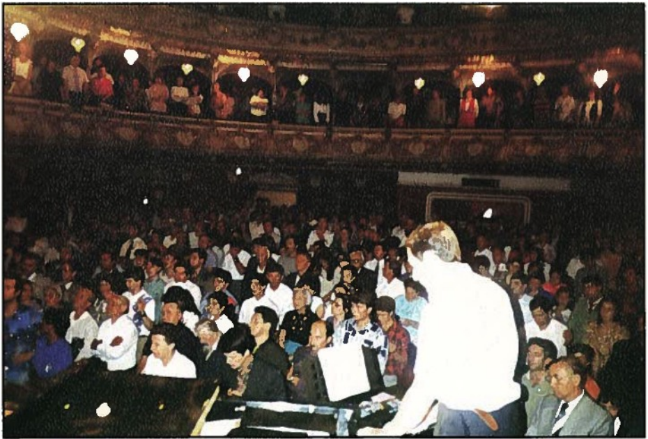
One of several meetings in 5 different cities in Romania in August, 1996: the packed State Theatre seating 3,000 people.