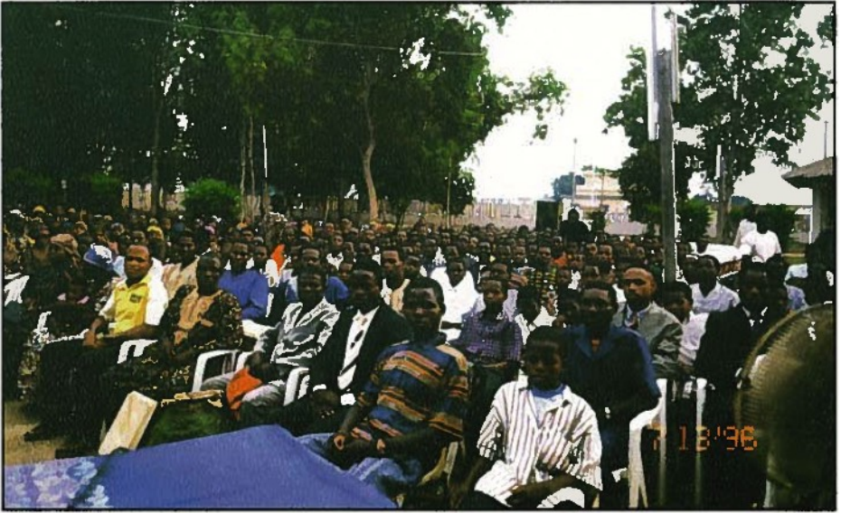
An audience in Cotonou, Benin, Central Africa, in July, 1996