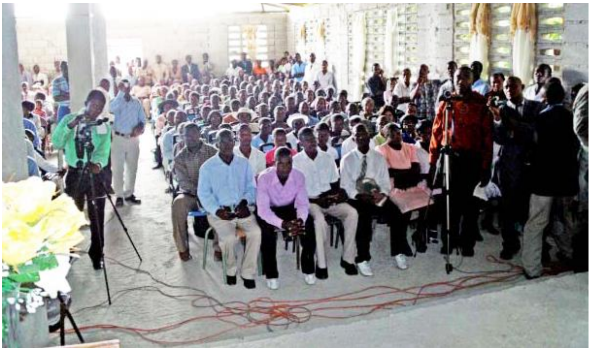
Ishusho y'uruhande rumwe rw'iteraniro ryabereye Port-au-Prince, muri Haïti tariki 14/03/2010