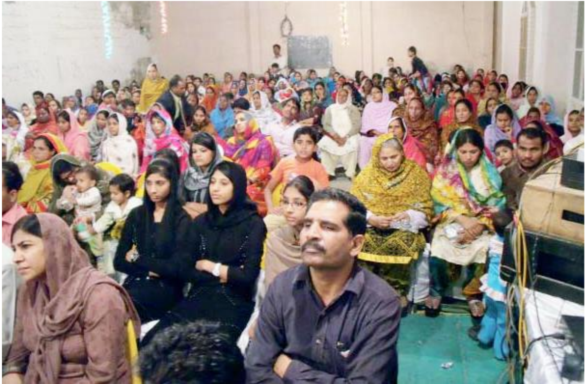
Ishusho y'uruhande rumwe rw'iteraniro ryabereye Islamabadi muri Pakistani tariki 20/02/2010