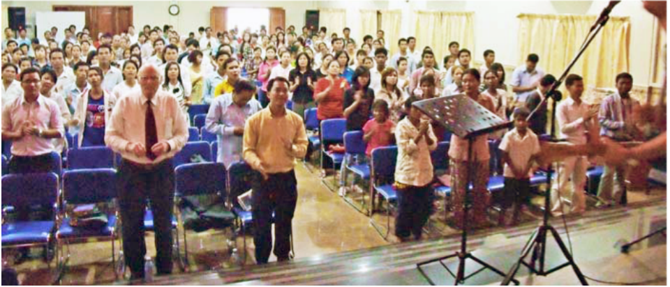
Ekishushani okuruga Phnom Penh, Cambodi