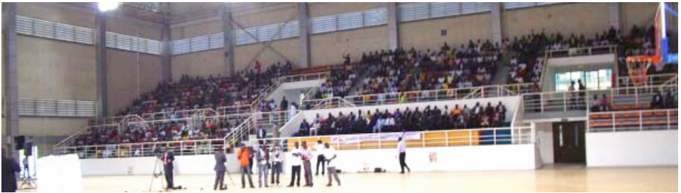
Ekishushani eki nikyereka ekicweeka kimwe ky`abantu baingi omu kishayi kya Luanda, Angola