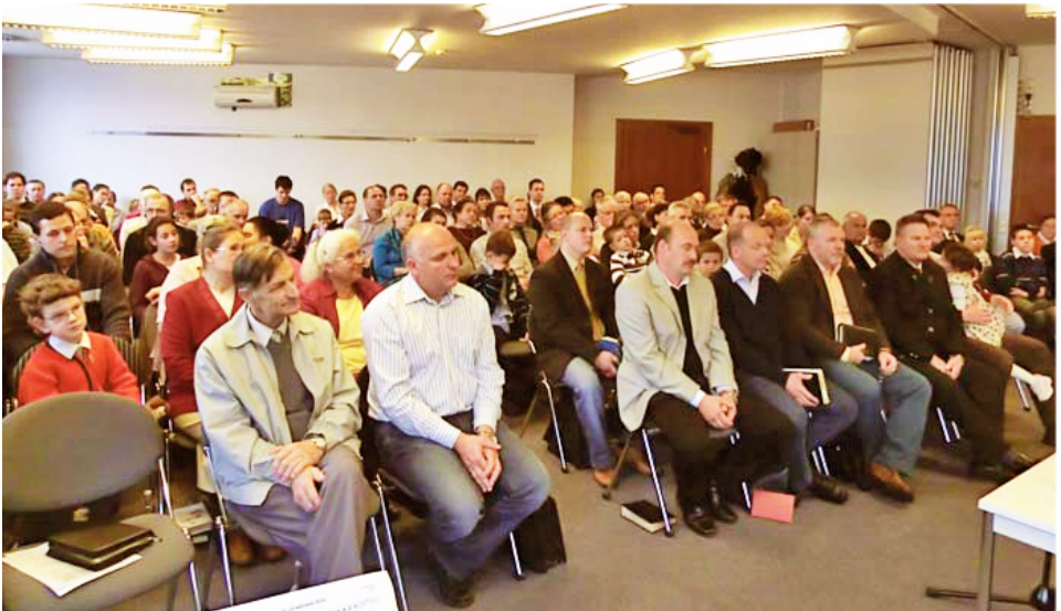
Ekishushani okuruga Graz, Austria.