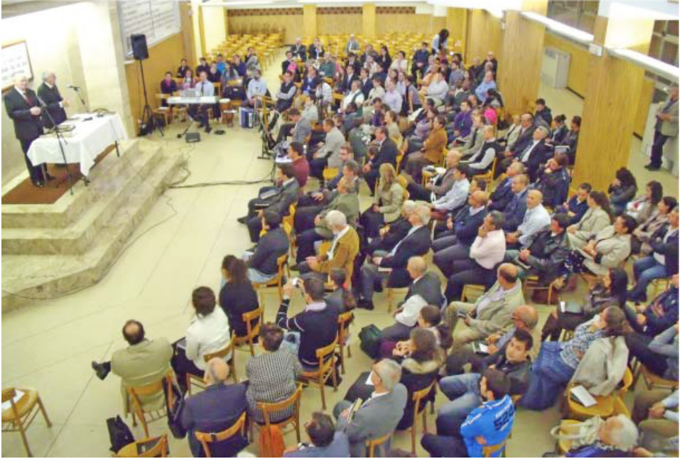
Oruterane omuri Rome, Italy