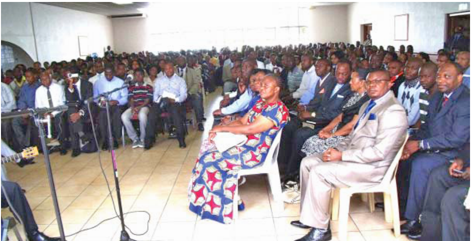
Oruterane omuri Johannesburg