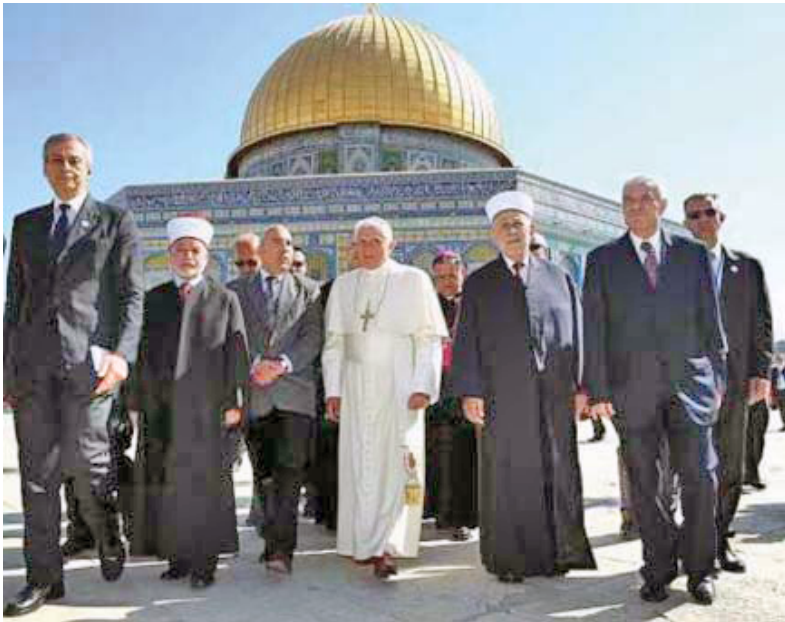
A photo with the Pope and the Palestinian representatives in front of the Dome of the Rock on the Temple Mount

By now, the Palestinians even agree to place the Temple Mount, the third holiest site in Islam, under the administration of a joint committee. Everything is under way for the establishment of a treaty that the Bible refers to as a covenant: “And he shall confirm the covenant with many for one week ...” (Dan. 9:27).