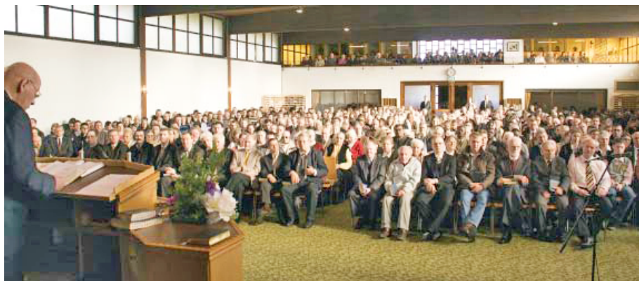
A picture of the assembly on February 5, 2012, in the Mission Centre in Krefeld, Germany

If you are interested in receiving our literature, you may write to the address below: