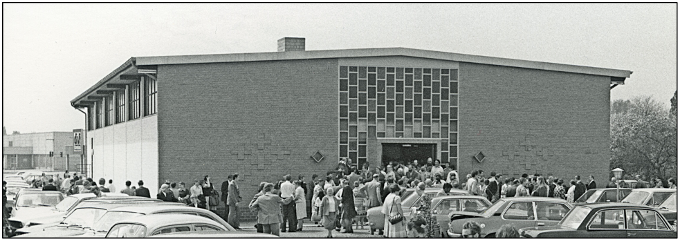
Ekishushani ky`ebyombeko bya mission bikiriyo nibyombekwa omuri 1977/78