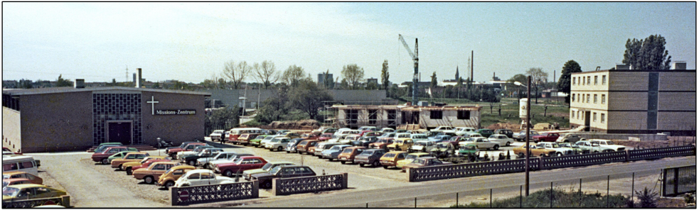
Oku nikwo twayigwiireho ekyombeko ky`Ekanisa omuri 1974