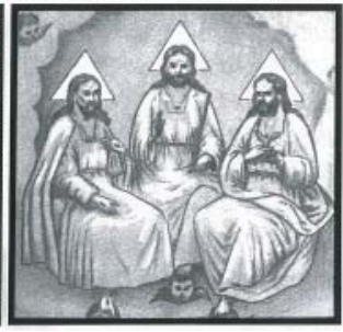
"I am the Lord thy God, which have brought thee out of the land of Egypt, out of the house of bondage. Thou shalt have no other gods before me. Thou shalt not make unto thee any graven image, or any likeness of any thing ..." (Ex 20:2-4). "Know therefore this day, and consider it in thine heart, that the Lord he is God in heaven above, and upon the earth beneath: there is none else." (Deut 4:39).

The introduction of the Trinitarian confession then also led to the persecution of the Jews. They were cursed and branded as murderers of Christ and of God. "Atone the death of the Crucified One on them!" was loudly proclaimed. In the year 321, they were forbidden to keep the Sabbath, and they were required to observe Sunday instead; synagogues were converted into cattle stables.