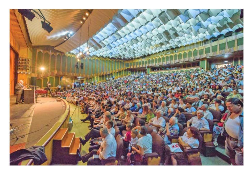
The photo shows the special meeting on Saturday, September 16, 2017, in Constanta, Romania, by the Black Sea.

Not only believers were in attendance there, but also people who were hearing a sermon for the first time. Among the more than a hundred people who came to the front for prayer were an Islamic newspaper reporter and a man from the Orthodox Church. Both accepted Jesus Christ as their Savior and were biblically baptized in the Black Sea two weeks later, together with all the other new converts. We thank our faithful Lord for this.