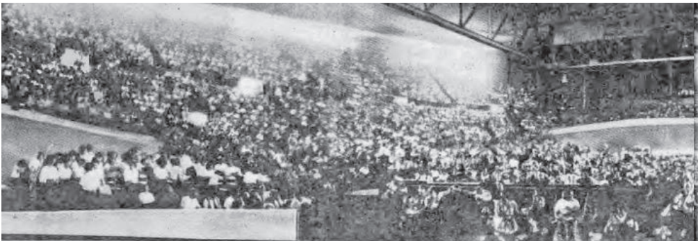
Rev. Branham spricht im

At Pentecost 1949, I dedicated my life to the LORD Jesus with tears of repentance and received the baptism of the Holy Spirit. Ever since, I can look back on a richly blessed life of faith with the LORD. By the grace of God, I have been preaching the Word of God