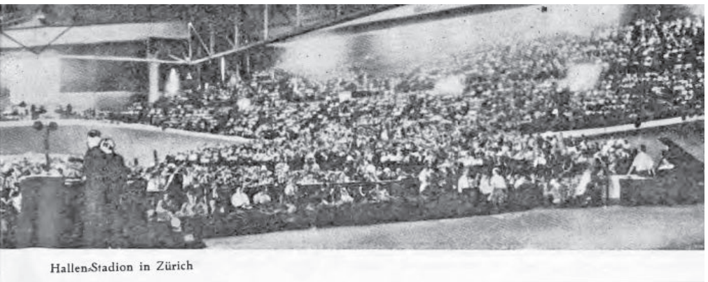
Hallenstadion in Zürich