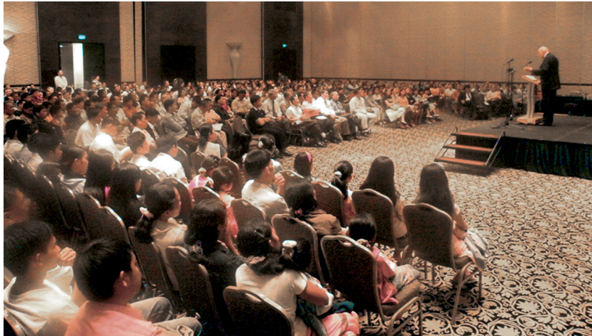
A meeting in Manila, Philippines, in September 2008.