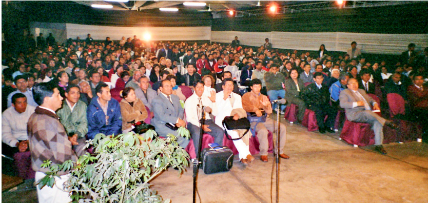
A meeting in Lima, Peru, in October 2007.