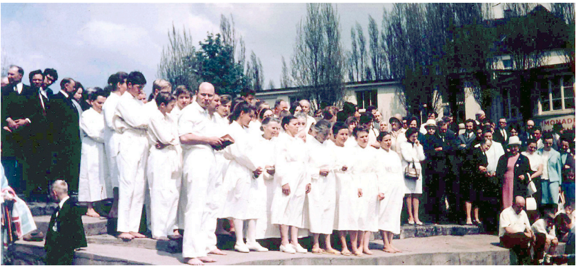
Since 1966 thousands of brothers and sisters have been baptised in the Name of the LORD Jesus Christ.