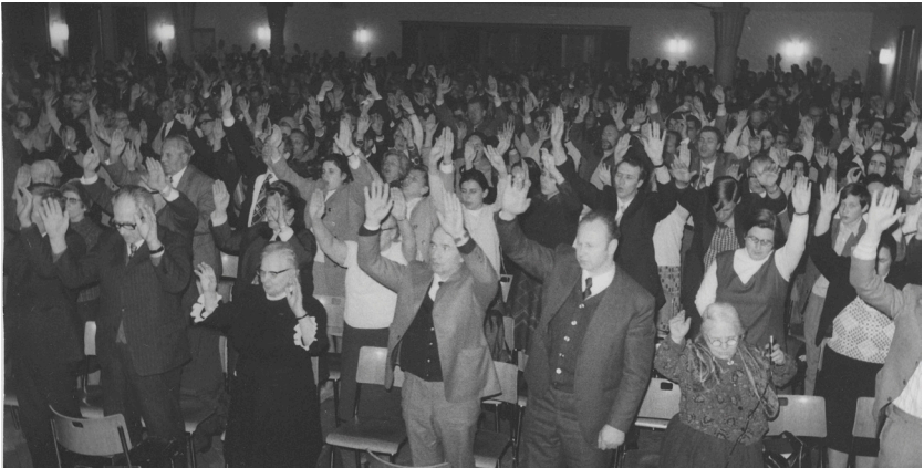
A meeting in Zürich, Switzerland, on Easter Sunday 1975.