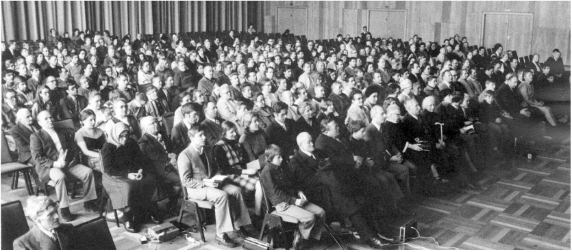
A meeting in Heilbronn, Germany, on Easter Saturday 1975.