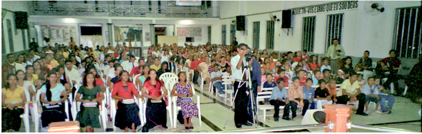
A meeting in Belém, Brasília, in October 2007.