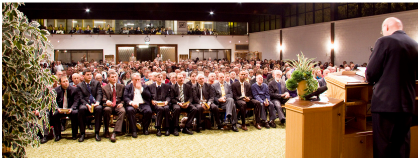
A meeting in the Krefeld Mission Center in November 2008.