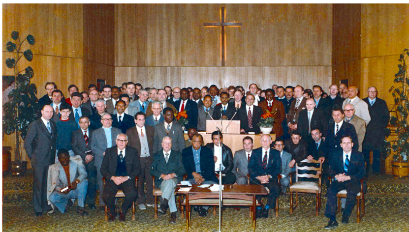
A photograph showing the international ministers' conference in April 1976, in which brethren from 33 countries participated

“And the Spirit and the bride say, Come. And let him that heareth say, Come ... Surely I come quickly. Amen. Even so, come, Lord Jesus.”