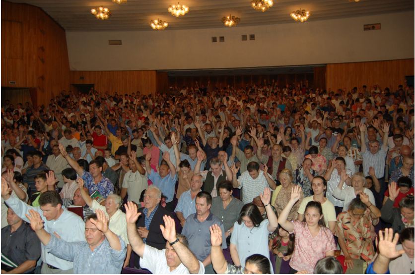
A photo of the congregation in Romania, August 2006. In this edition we can only publish a few of the many photos we have from all over the world.