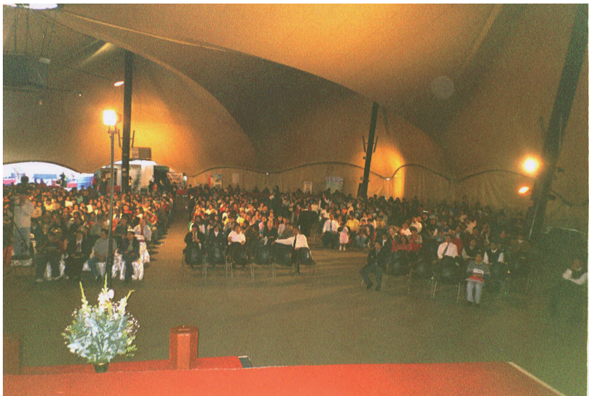
A meeting in Lima, Peru, October 2005.